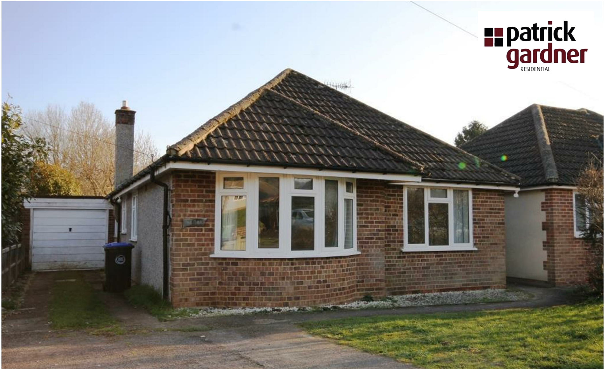
55 Hillside Gardens, Brockham, Betchworth, Surrey, RH3 7ER